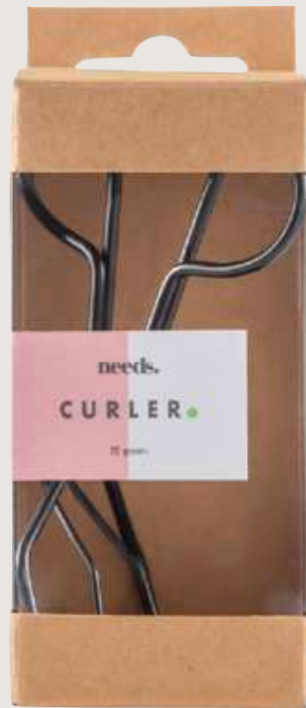
EYELASH CURLER MOQ: 6