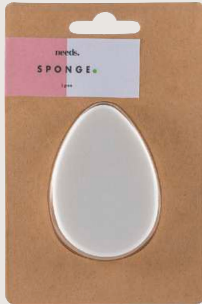
MAKEUP SPONGE MOQ: 6