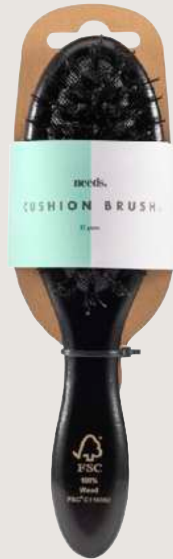
CUSHION BRUSH SMALL FSC® 100% MOQ: 6