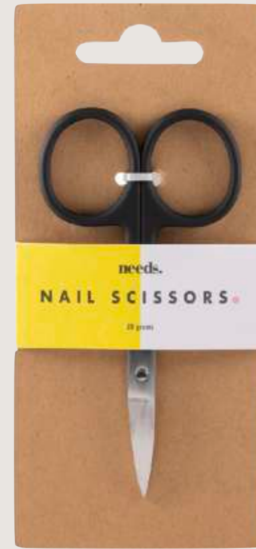
NAIL SCISSOR MOQ: 12