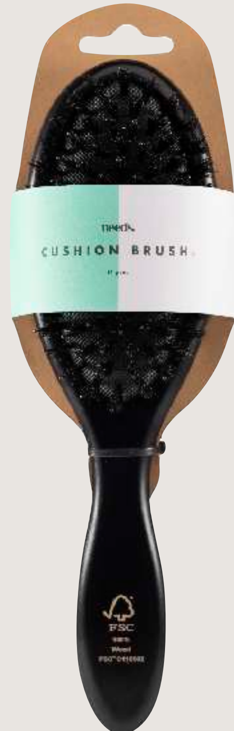
CUSHION BRUSH FSC® 100% MOQ: 6