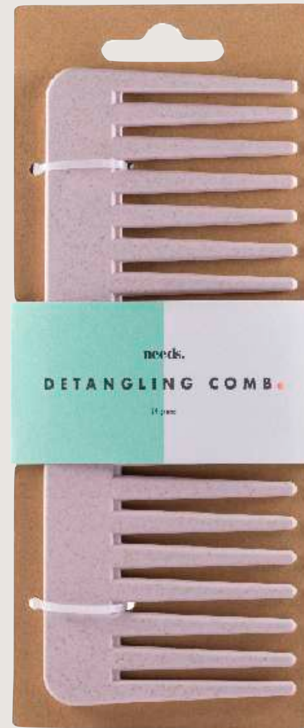
DETANGLING COMB PLA MOQ: 12