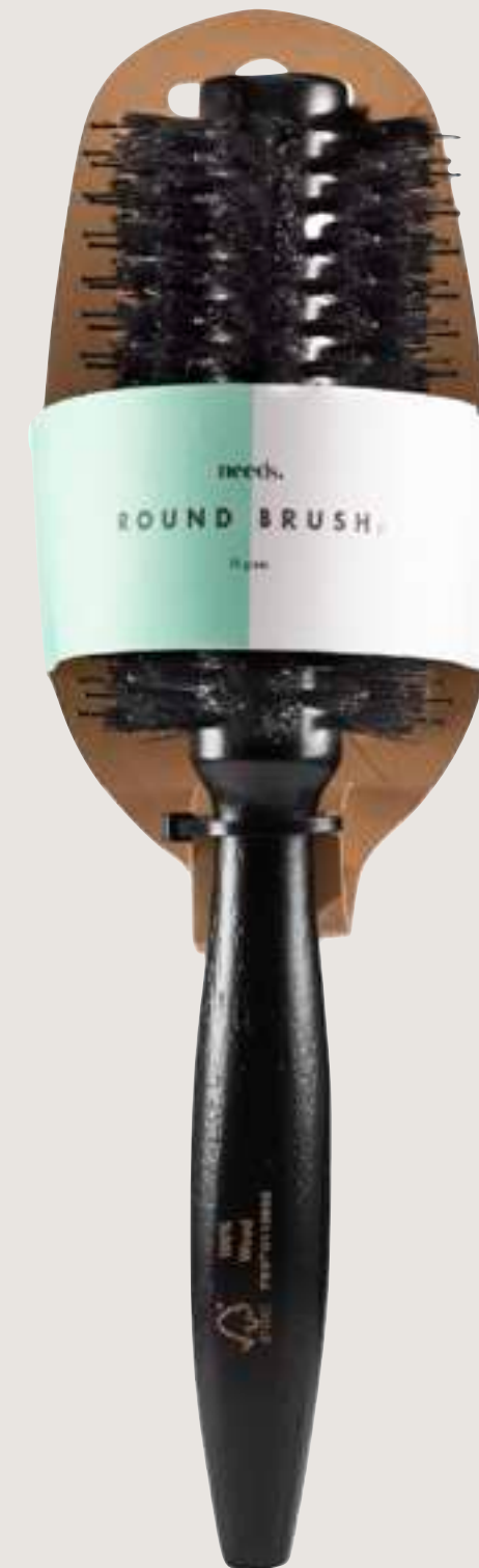
ROUND BRUSH FSC® 100% MOQ: 6