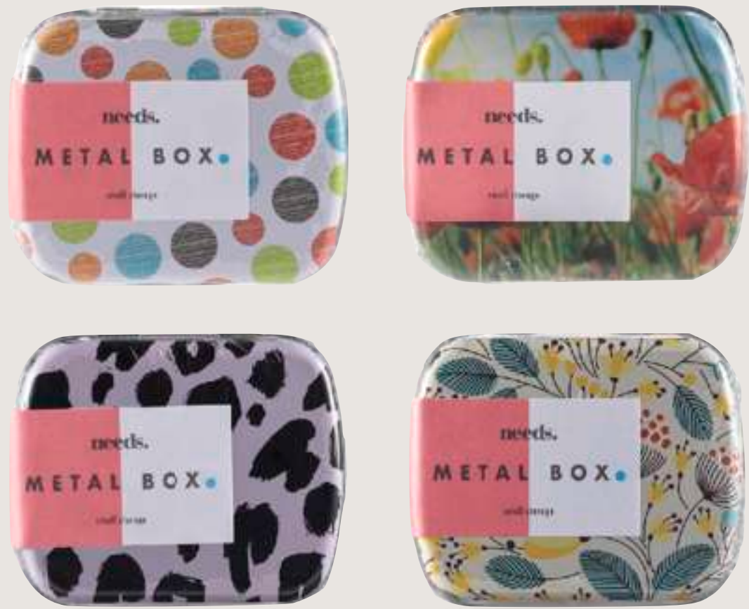
PILL BOX METAL MOQ: 12