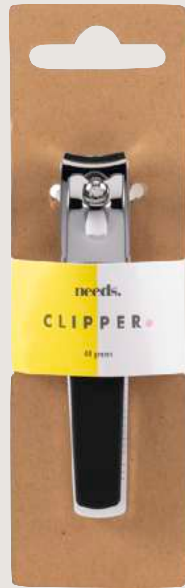
NAIL CLIPPER LARGE MOQ: 12