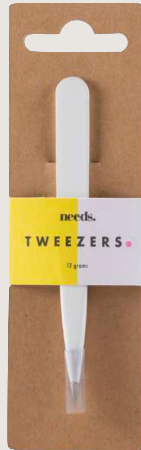
TWEEZER POINTED MOQ: 12