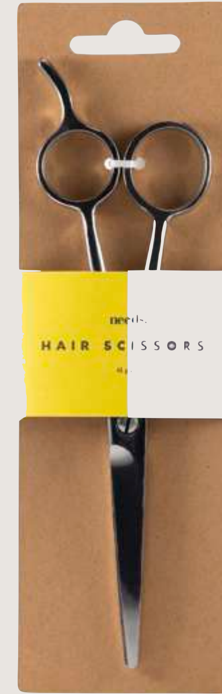
HAIR CUTTING SHEARS MOQ: 12