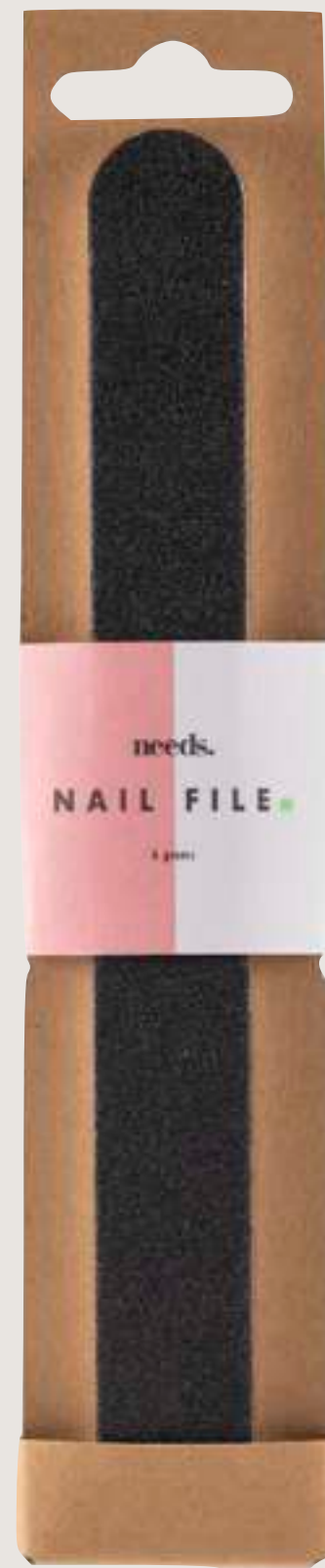
NAIL FILE MOQ: 12