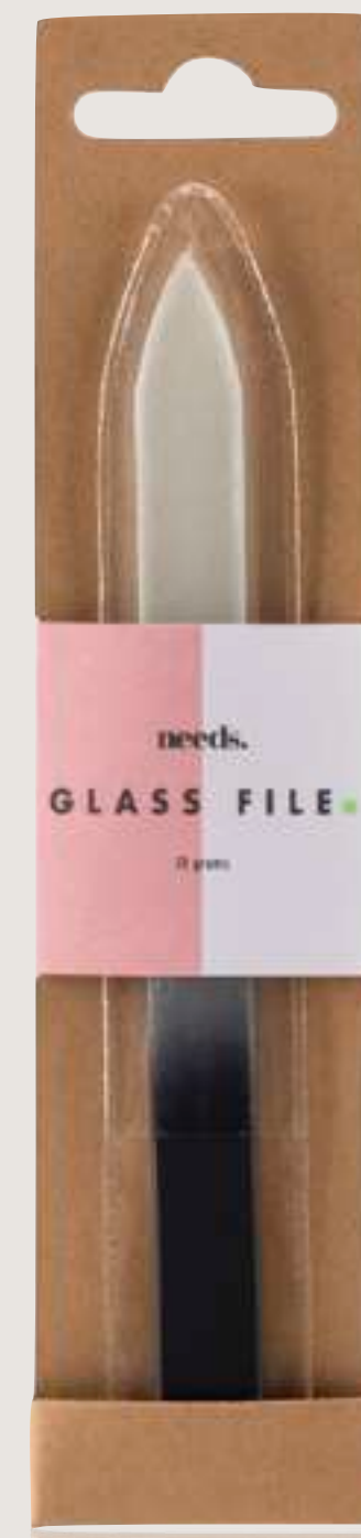
GLASS FILE MOQ: 12