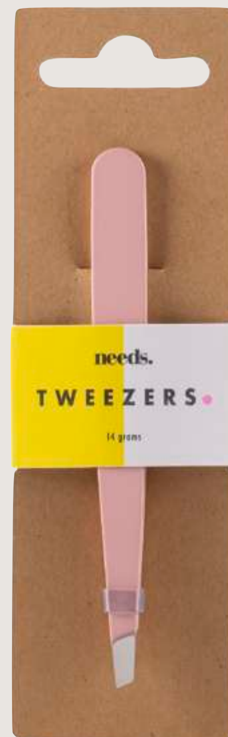
TWEEZER SLANTED MOQ: 12