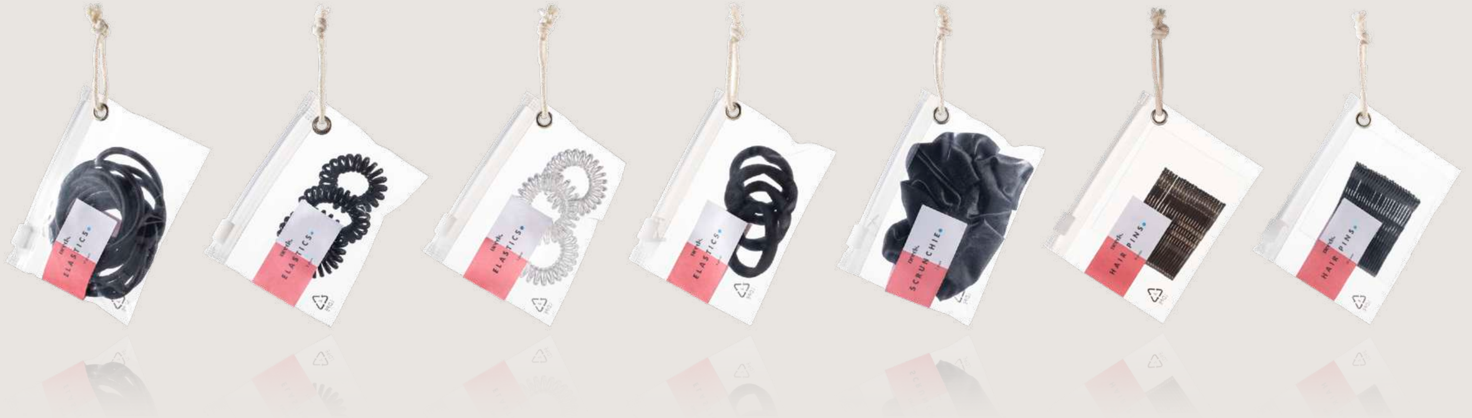
HAIR PINS BLACK 24-P MOQ: 12