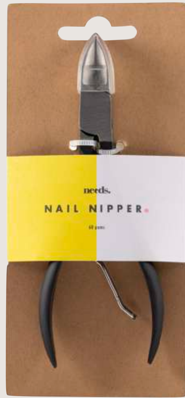
NAIL NIPPER MOQ: 6