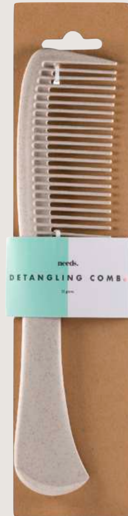
DETANGLING COMB HANDLE PLA MOQ: 6