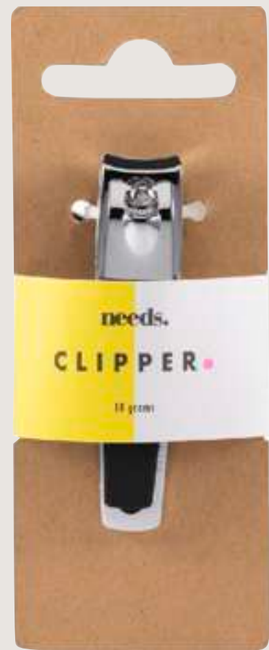
NAIL CLIPPER SMALL MOQ: 12