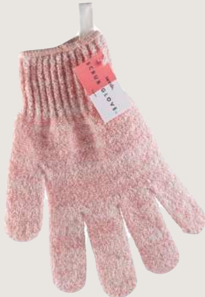
SCRUB GLOVE RPET MOQ: 12