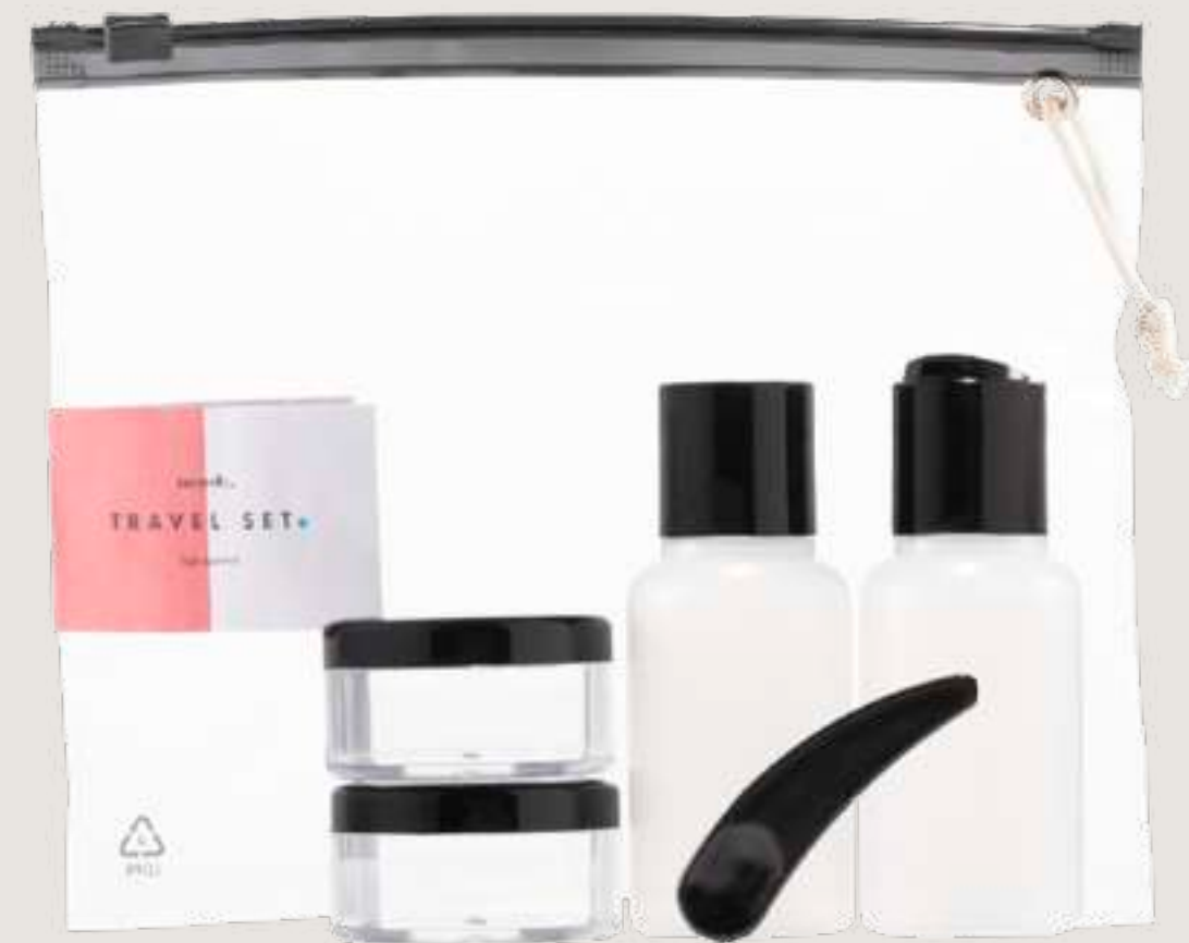
TRAVEL SET MOQ: 6