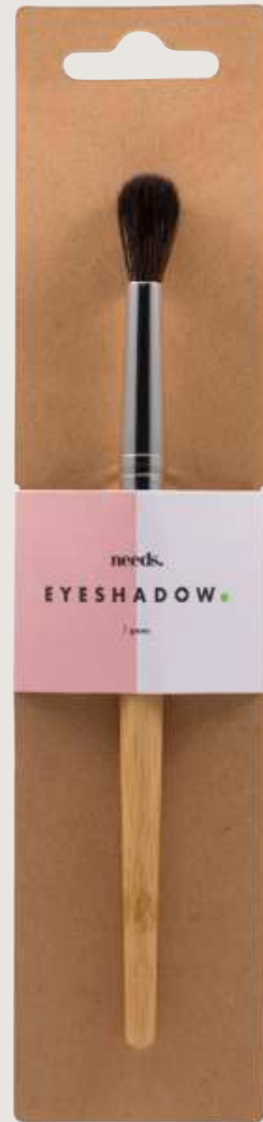
EYESHADOW BRUSH FSC® 100% MOQ: 6