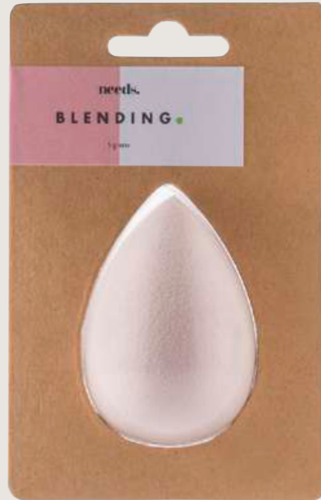
BLENDING SPONGE MOQ: 6