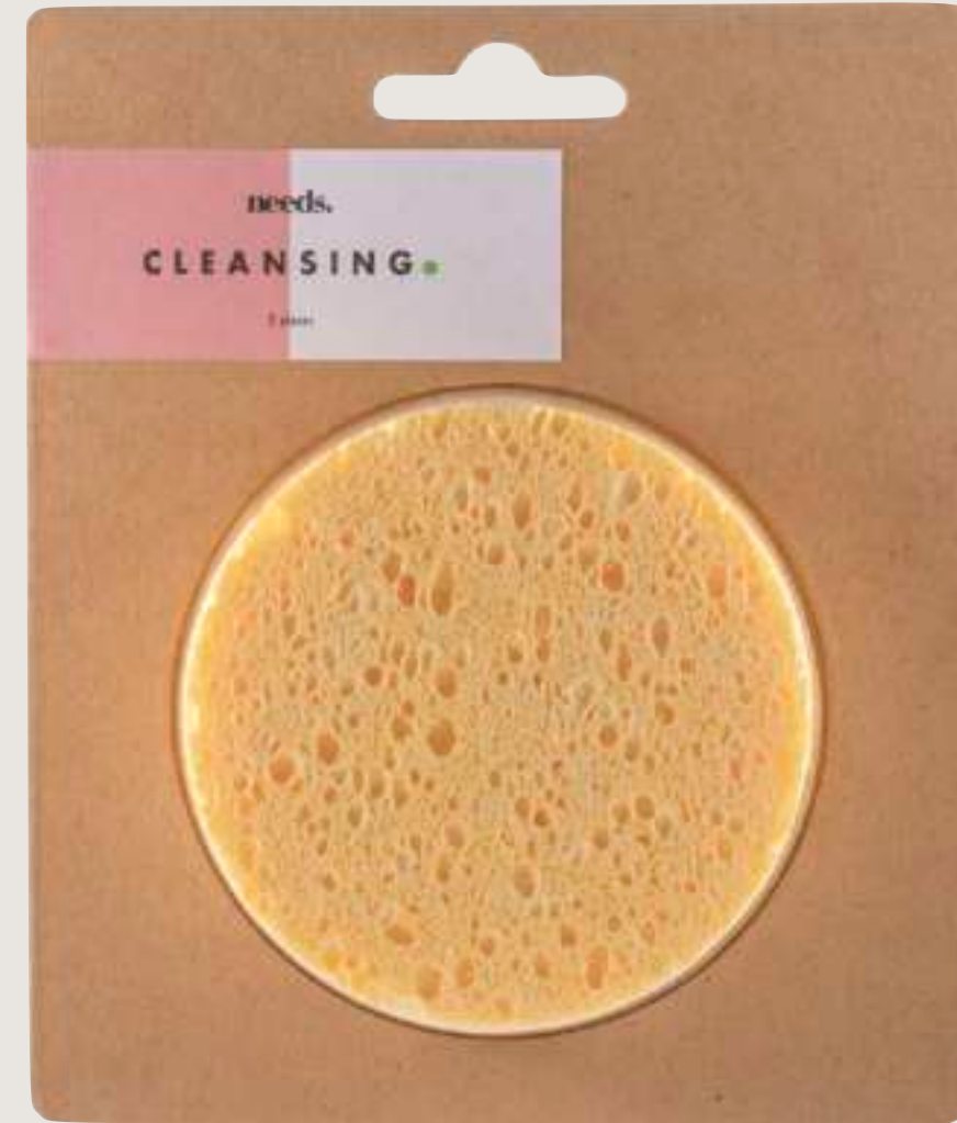
FACIAL SPONGE 2-P MOQ: 6