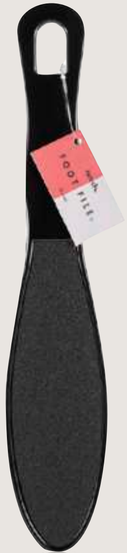
FOOT FILE PLASTIC ABS MOQ: 12