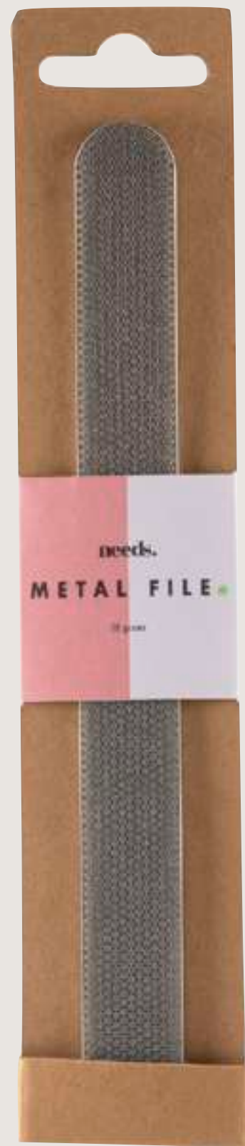
METAL NAIL FILE MOQ: 12