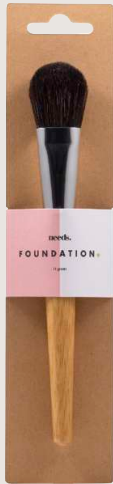
FOUNDATION BRUSH FSC® 100% MOQ: 6