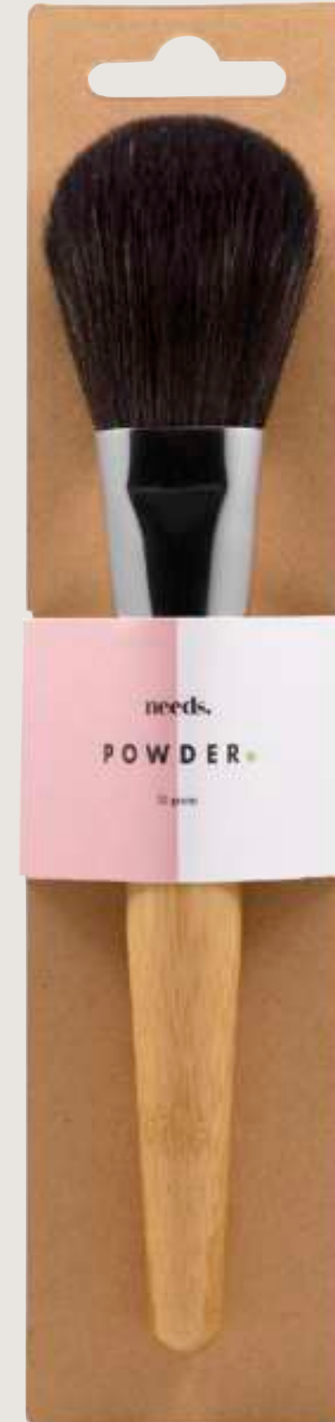
POWDER BRUSH FSC® 100% MOQ: 6